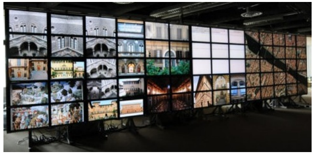
(a) The HIPerSpace Wall Display