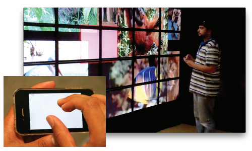
Figure 3. The Overlay interface: the translucent rectangle<sup>1</sup> is superimposed on part of the three photos displayed on the wall

One of the inherent limitations of the devices above is that they are positioned at a fixed location and thus restrict the movement of users. We thought mobile devices would promote different forms of interaction and exploration with the HIPerSpace wall. In order to test the use of mobile devices, we built an iOS 4 application<sup>5</sup> for the Apple iPhone and iPod Touch. Given that these devices are personal, likely to be only used by one user at a time and rarely shared, and given their size, we assigned one Overlay per device (shown in Fig. 3).