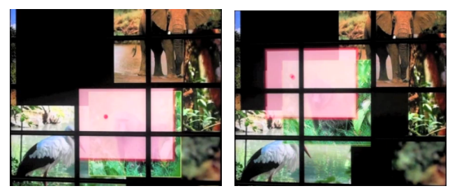
Figure 5. Dragging the Overlay with a photo selected

If any objects within the Overlay are selected when it is moved, they move along with it, i.e. their position remains fixed relative to the Overlay (Fig. 5).