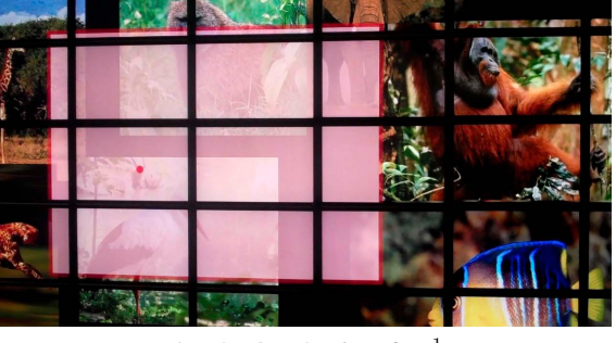
(b) The Overlay interface<sup>1</sup>

Figure 1. Overlays enable collaborative interaction on ultra-scale wall displays