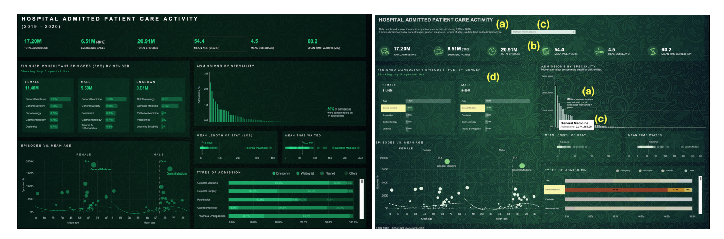
Fig. 3: Dashboard used in Part B classroom exercise. Left: Original dashboard. Right: Modified dashboard. Updated dashboard annotated in yellow based on heuristics from the conversational states, indicated by H#: (a) Initiation: The text in the dashboard is updated to provide more context (H6). (b) Grounding: Dashboard contains iconography to add meaning to the data being presented (H17). (c) Turn-taking: The dashboard is updated to add filtering across views (H28). (d) Close: The "Unknown" category was removed from the original dashboard to further clarify the takeaway of the dashboard (H37). Note that students made aesthetic changes (not always an improvement), such as modifying the dashboard's background in addition to applying the heuristics. (Permission granted to use original and modified dashboards).

Turn-taking . For this conversational state, there was a lower frequency of application ratings (41) and a higher frequency of violations (68), indicating the limited interactivity (H25) that the dashboards provided. P20 stated, "The dashboard should update its view based on what is selected, highlighted, or filtered by the user. As there are no filters and update options available in the dashboard." Participants also noticed some friction when interacting with the dashboard (H26). P3: "The process of zooming in is clunky and disrupts continuity." and guiding to the next step. P3: "Very little visual warning/cueing to accompany changes to graphs, particularly in the side panel. Some changes are initially off screen and have to be scrolled to."