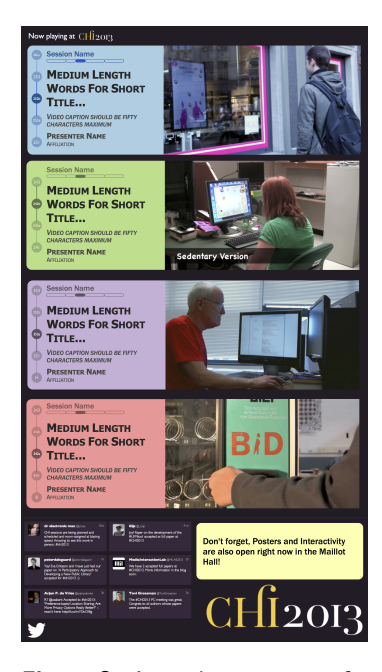
Figure 3: An early prototype of the upcoming mode which features each corridor of the conference venus as a line on a metro system.

affordances of private-view mobile controllers over having a shared controller tethered to the large display? How do attendees compete for real estate on shared displays? Do they collaborate, physically wait in line, or expect the system to enforce an ordering? Our data collection will consist of anonymized activity logs and in situ observations.