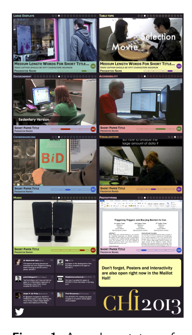
Figure 1: An early prototype of the interactive filtering mode with 8 tiles. Each tile features a video and title-card information for a playlist of items matching a filter applied to the conference schedule.