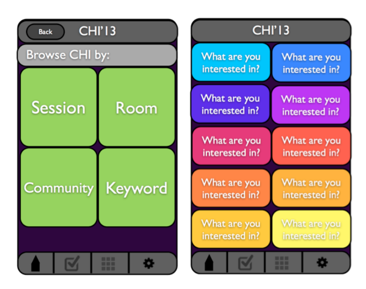
Figure 4: An early prototype of the mobile interface. (a) (left) Choosing to filter the conference by session, room, community or keyword. (b) (right) The main mobile interface which maps to the interactive filtering tiles view.

The CHI'13 mobile application is attendees' primary mechanism for interacting with the large displays. Implemented as an HTML5 web application embedded in the larger CHI'13 mobile application, attendees begin by selecting which large display they would like to connect to. If the chosen screen is setup for interactive filtering. an attendee can select a particular time context (now, next sessions, or the entire conference) and then begin to define a filter (e.g. by community, keyword, or session) – Fig. 4(a). Once a filter has been chosen. the interface POSTs this